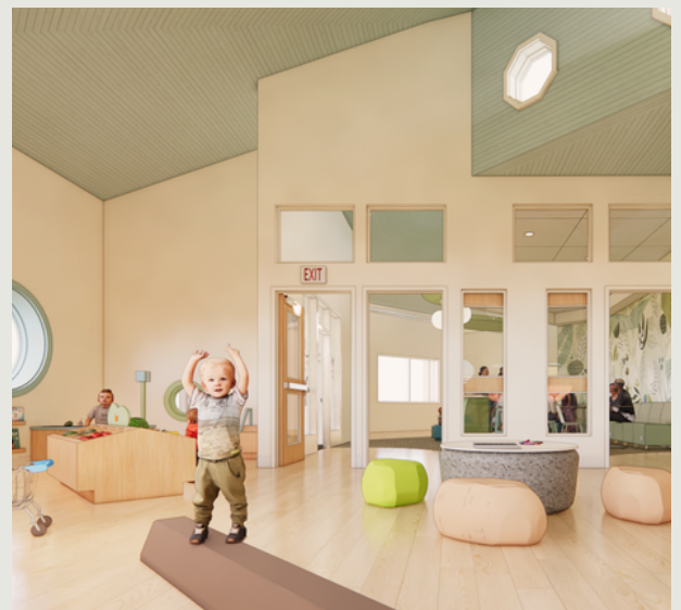
Bartlett & West renderings of our new Early Childhood Community Center